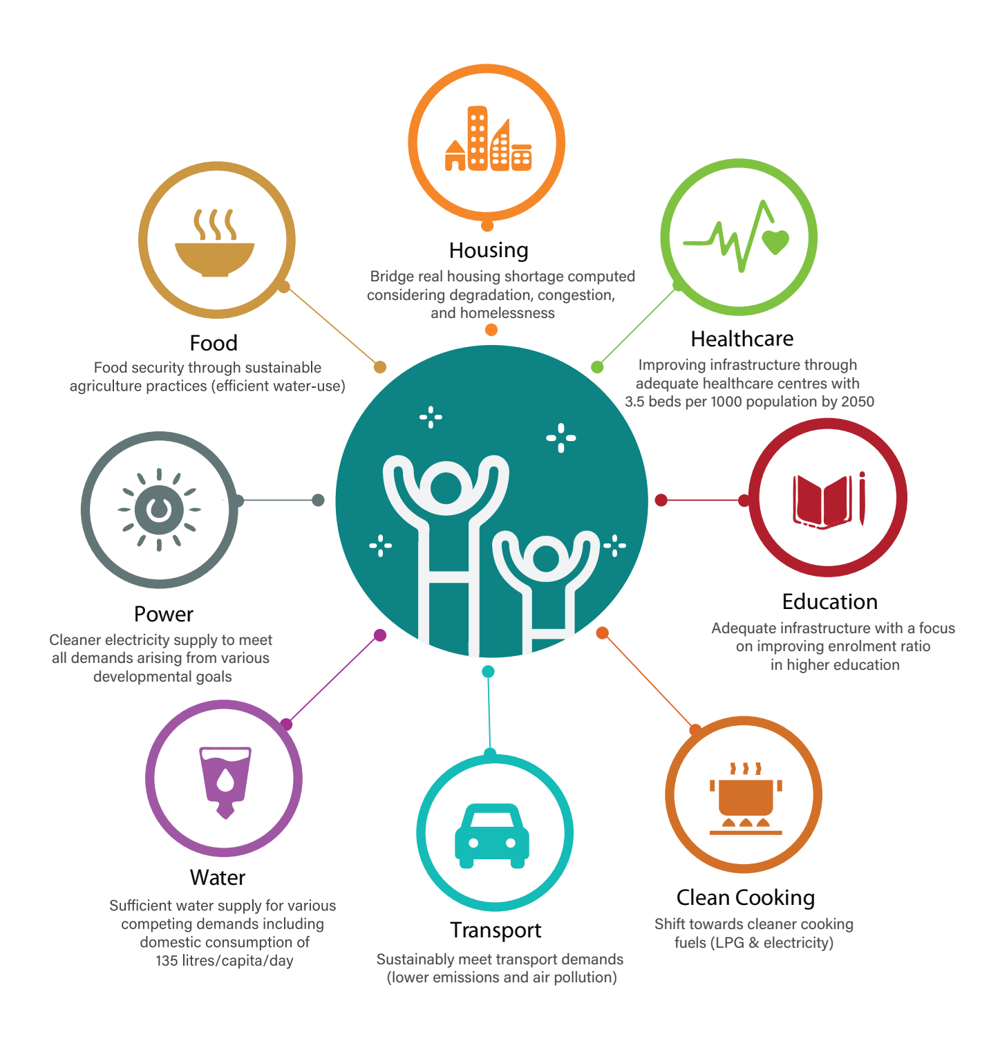
Figure 1: Developmental goals in SAFARI